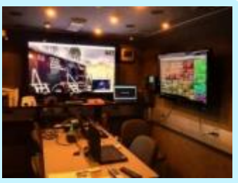
Network Emergency Response Vehicles